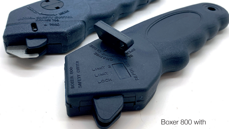
Boxer 800 with security key in situ