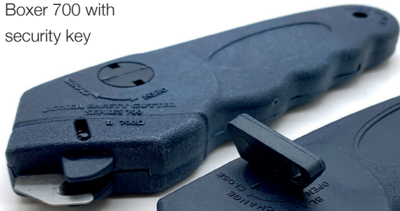
Boxer 700 with security key